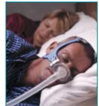
Comfortable yet stable—a great night's sleep for everyone