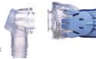
One Snap Elbow

The One Snap Elbow makes attachment and detachment of the mask and the air tubing quick and easy. This is especially convenient when you need to visit the rest room at night—just detach the elbow from the mask before you go and snap it on again when you return to bed.