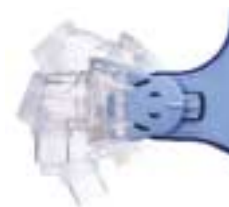
Fit Angle Selector

Mirage Vista is designed with easy-lock parts and more preassembled parts. Even if your vision is no longer 20/20, or if your fingers aren't quite as nimble as you may want them to be, you will find the Mirage Vista easier to put on, take off, clean, and handle than other masks.