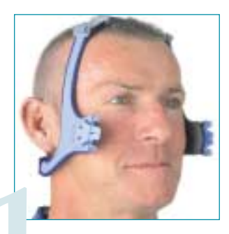
Adjust each side vertical strap so that lower strap sits just below ear (not touching it).