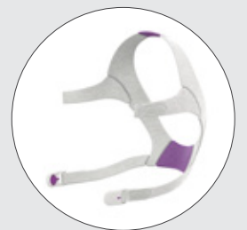
AirFit N20 for Her headgear with headgear clips 63558 (S)